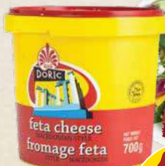
Doric Macedonian Style Feta Cheese 700 g