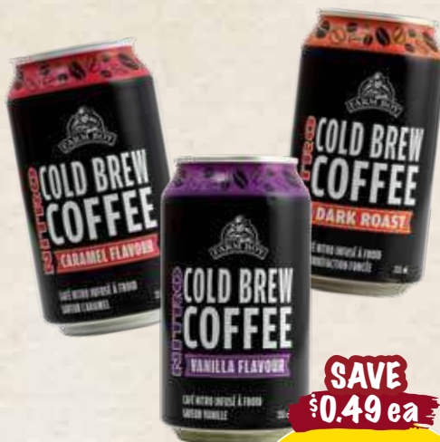
Farm Boy™ Nitro Cold Brew Coffee all varieties, 355 mL