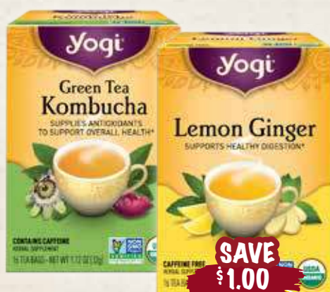
Yogi Herbal Tea all varieties, pkg of 16