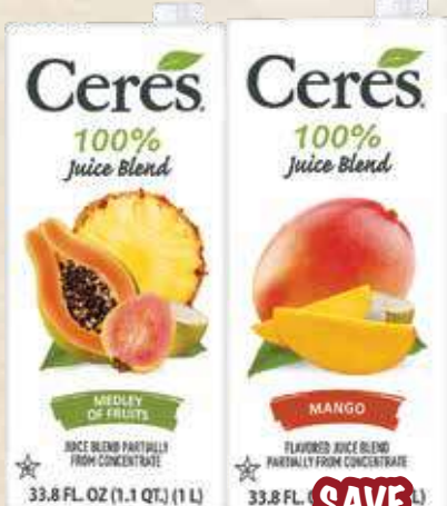
Ceres 100% Juice Blends all varieties, 1 L