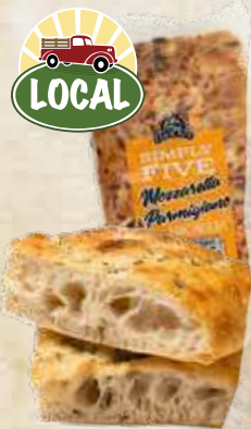
Farm Boy™ Simply Five Focaccia all varieties, 600 g