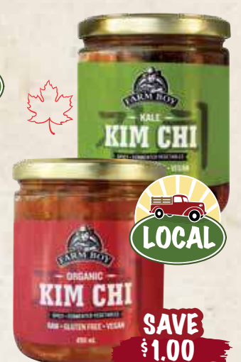
Farm Boy™ Kimchi all varieties, 490 mL