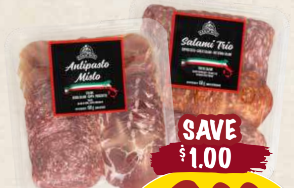
Farm Boy™ Antipasti or Salami Trios Antipasto Misto, Salami Trio, and Antipasto Italian Trio, 150 g