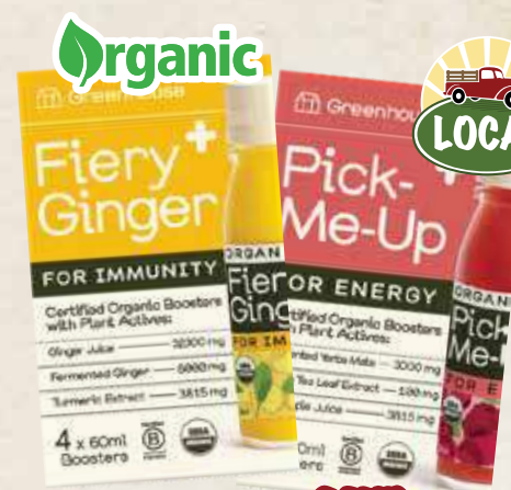
Greenhouse Boosters all varieties, 4x60 mL