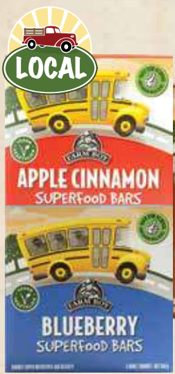
Farm Boy™ School-Friendly Cookies & Bars all varieties, 168-240 g